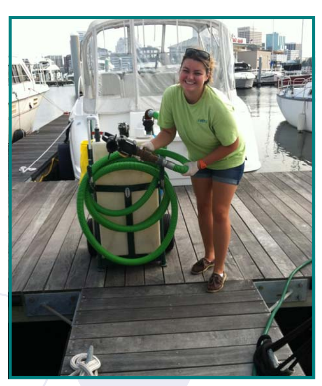
HRSD Marina Interns make it easy for boaters to protect area waterways.

By remembering to Pump Out, Don't Dump Out, you'll help us ensure future generations inherit clean waterways and are able to keep them clean. Find out more about our Boater Education and Pump Out Program and schedule your pump out at <a href="http://www.hrsd.com/boatereducationproject">http://www.hrsd.com/boatereducationproject</a>.